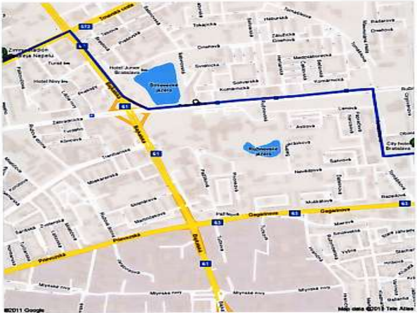
Map of distance from hotel to Ice rink cca 3000m by car

Trasa do cieľa: Zimný štadión Ondreja Nepelu Odbojárov 9, B3104 Bratislava-Nové Mesto - 02 4437 2828 3,0 km – približna 6 min