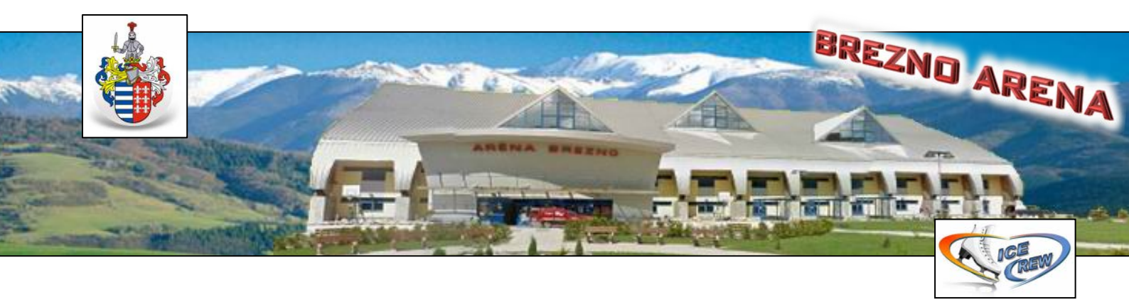
FIGURE SKATING CAMP BREZNO 2017